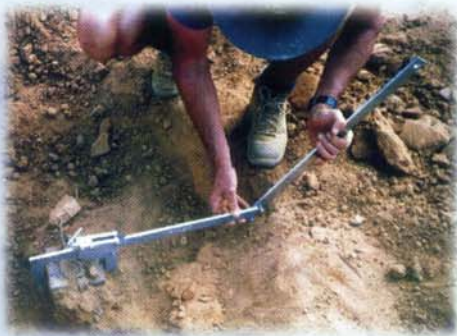
Anti-Tank mine hook