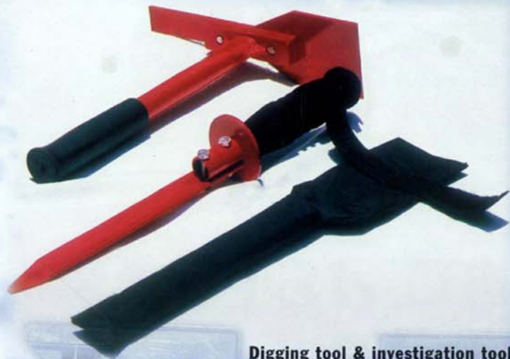
Digging tool & investigation tool