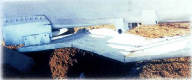
TMRP - 6 Mine protection kits